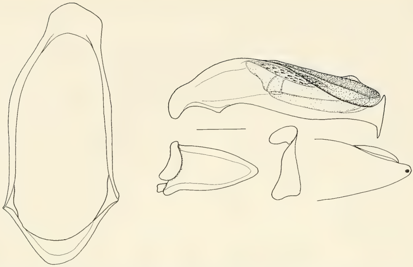
Fig. 1. Gunvorita bihamata , spec. nov. ♂ genitalia: aedeagus (left side), shape of apex (from below), left and right parameres, genital ring. Scale: 0.25 mm.

posteriorly widened, rather oval shaped head; further distinguished from the next relatives, G. hamifera Baehr and G. nepalensis Baehr, by shape of aedeagus which has the apex sharply upturned and bears a straight crotchet at the very tip that forms a straight line with the apex.